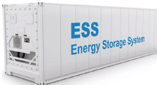
Energy Storage Systems(ESS)