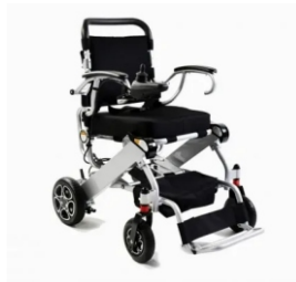
Electric Skateboard, Wheelchair