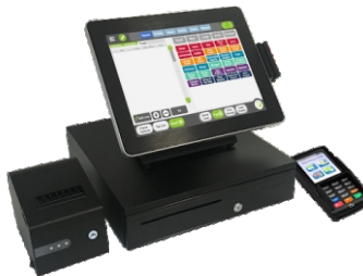
Point Of Sales Products