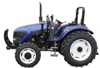
Electric Agricultural Equipments