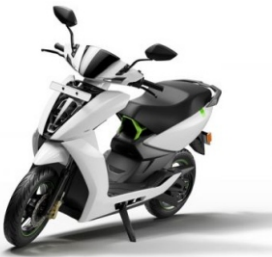
Electric Two Wheeler